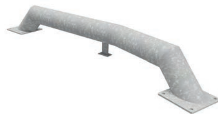
AMTR-N ANGLED guide

The AMTR-N STRAIGHT steel guide is 1840 mm long. Its frame and feet are made of circular steel profiles with a diameter of 159 mm. The whole is attached to square bases made of flat sheet metal.