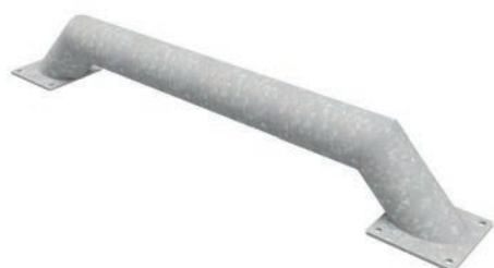
AMTR-N STRAIGHT guide

The AMTR-N STRAIGHT steel guide is 1840 mm long. Its frame and feet are made of circular steel profiles with a diameter of 159 mm. The whole is attached to square bases made of flat sheet metal.